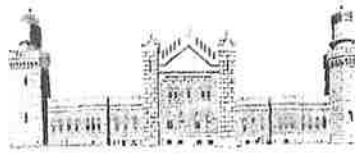
HISTORIC "TWIN LIGHTS"

171 BAY AVENUE 07732 COUNTY OF MONMOUTH PHONE: 732-872-1224 FAX: 732-872-0670 WWW.HIGHLANDSNJ.COM