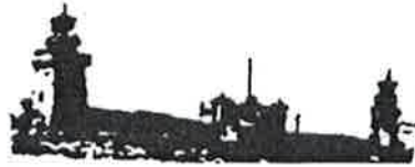
HISTORIC "TWIN LIGHTS"