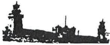
HISTORIC "TWIN LIGHTS"