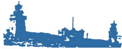
HISTORIC "TWIN LIGHTS"