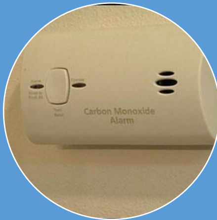
BATTERY- OPERATED CARBON MONOXIDE ALARM