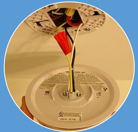
HARD- WIRED CARBON MONOXIDE ALARM

CARBON MONOXIDE ALARMS SHALL BE INSTALLED, BY ANY ONE OF THESE METHODS, IN THE IMMEDIATE VICINITY OF EACH SLEEPING AREA.