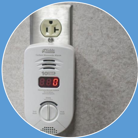
PLUG-IN CARBON MONOXIDE ALARM